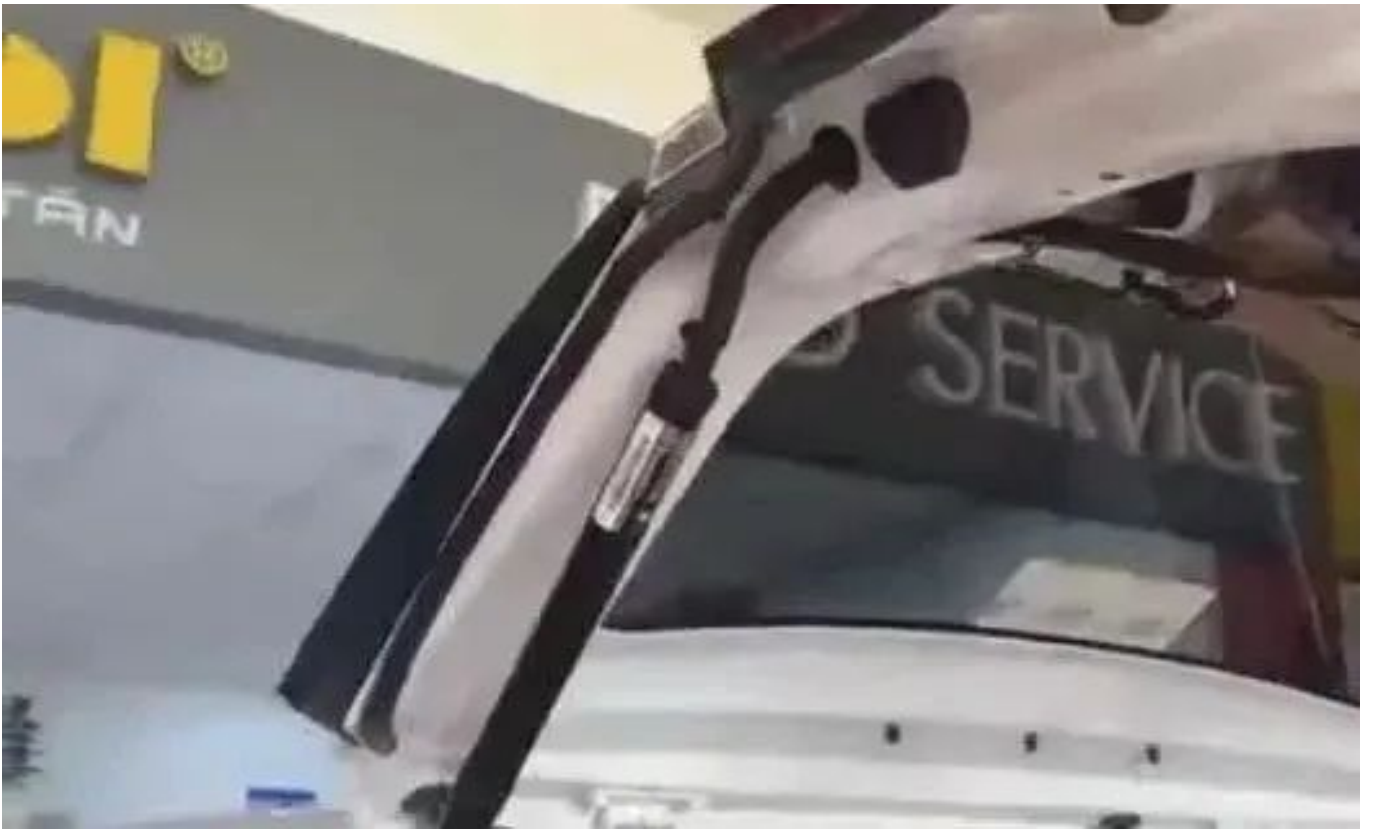
4.汽车尾部关门按键安装Door close button installation at the rear of the car