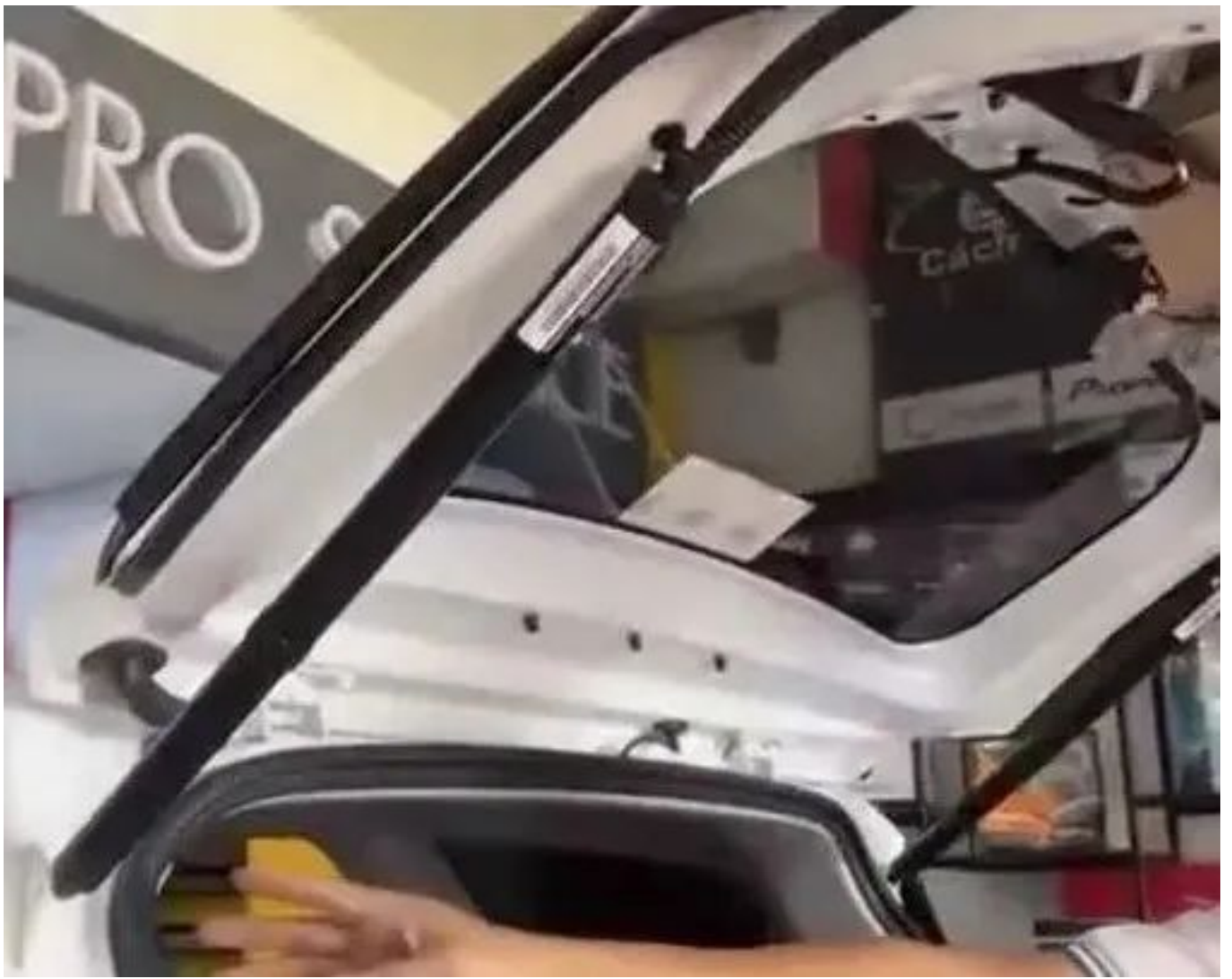
2.用原车下支架安装我司电动撑杆Use the original car bracket to install our electric strut