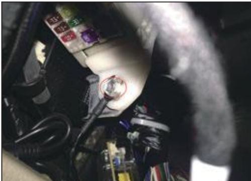
8. Connect grounding wire under main driver compartment