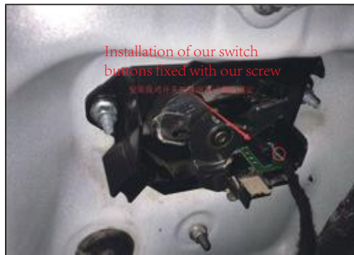
14. Installation of tailgate handle switch