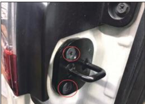
10. Remove the original car lock, install our lock ring and flat washer, and fix it with screw