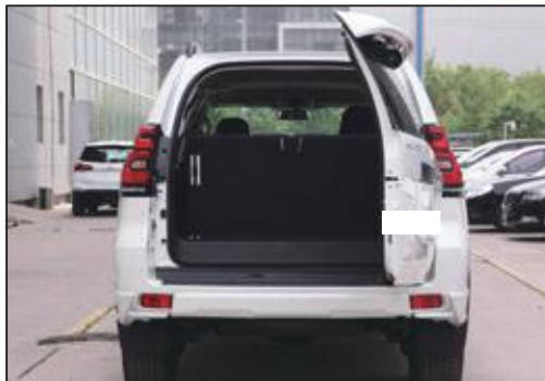
16. Installation completed

After completion, please make sure that the tail door can be switched in place (open the tail door to the desired width, press the tail door to install switch keys, hear a "beep" in 3-5 seconds, release the handle, press the tail door button to close the door, the tail door closes in place, and then hear a "beep" sound, that is, the tail door learning is completed, such as If you can't close the door, push the door with your hand to close it.