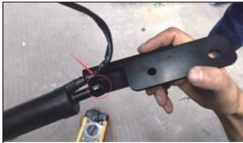
3. Fix the electric pole to the bracket first