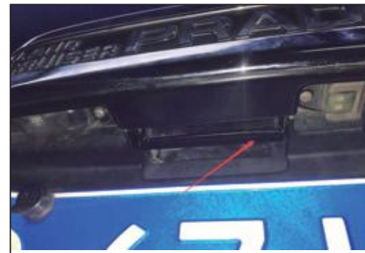
15. Installation of tailgate switch is completed