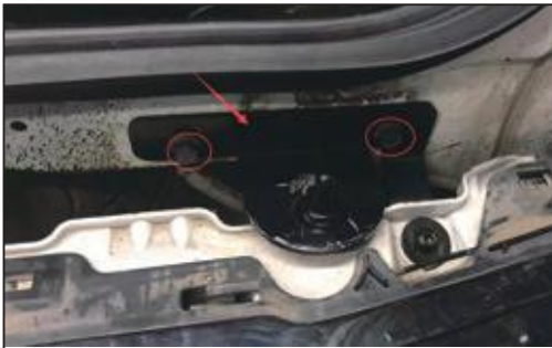
5. Remove the lower ball head of the original car and install the upper bracket of our company