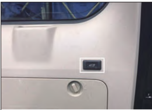
11. Punch holes in the tailgate to install the tailgate switch