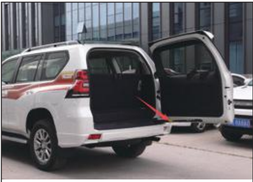
1. Remove the original lower support pole