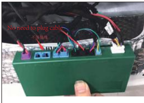
12. Insertion method of control box