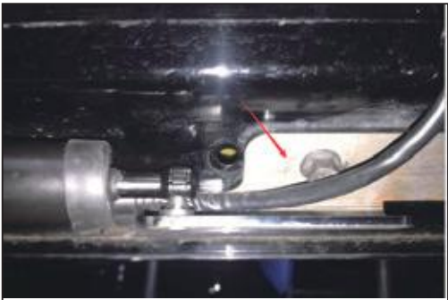
4. Then install the bracket and fix with screw.