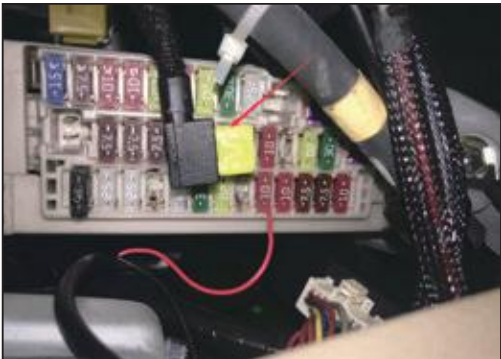
7. Draw electricity under the main driver compartment