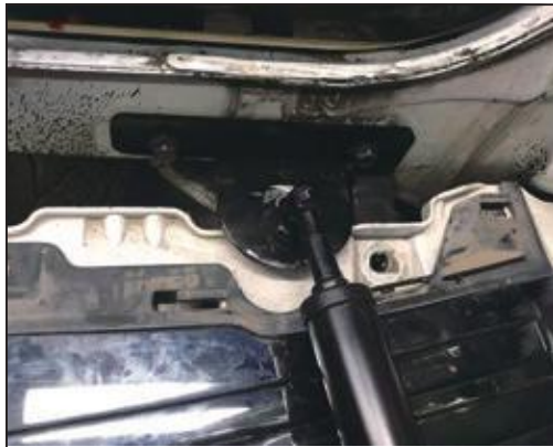
6. Install electric pole