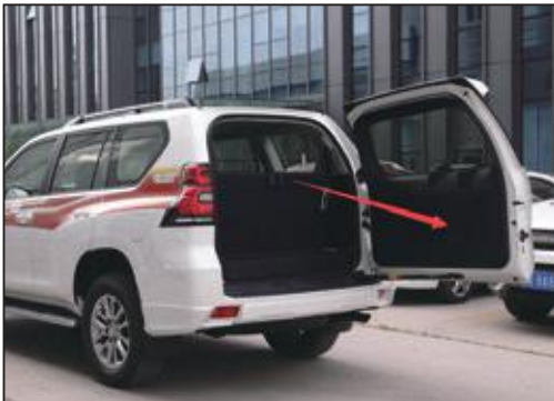
2. Remove the original car trim